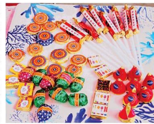
पटाखों के डिजाइन में बनाई गई चॉकलेट

शिवाजी कॉलेज में इनपुट्स सोसायटी की ओर से दिवाली मेले का आयोजन किया गया। इसमें दिल्ली विश्वविद्यालय के विभिन्न कॉलेजों से आए छात्रों ने स्टाल लगाई। इसमें मेस व खानपान की स्टाल भी शामिल थी। दिवाली मेले के लिए कॉलेज को भूतलों व छात्रों की ओर से वेस्ट मैटेरियल से तैयार की गई चीजों से सजाया गया था। मेले के लिए छात्र पारंपरिक ड्रेस में तैयार होकर आए थे। स्टाल में विशेषकर चॉकलेट, चांदनी